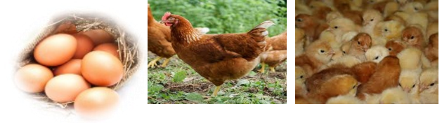
TABLE EGGS SURVEY

This survey began in 1969. The revised survey design utilizes a census of all farms. It is conducted 3 times per year.